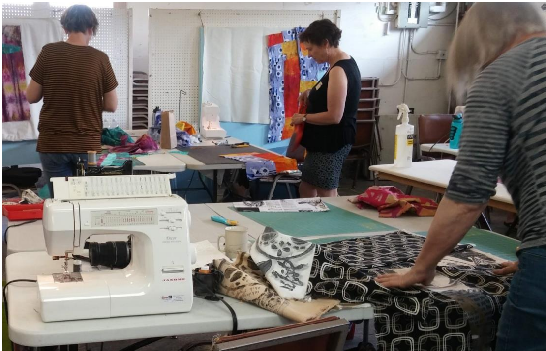
Students working in the studio space